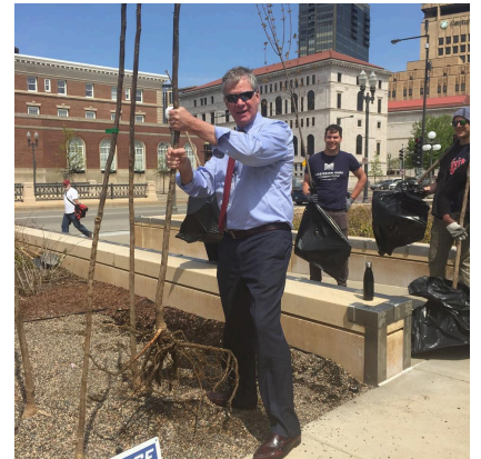
Mayor Chris Coleman participating in the Forum's community tree planting event.